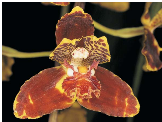
Rudolfiella picta 'Tres Jolie' AM/AOS