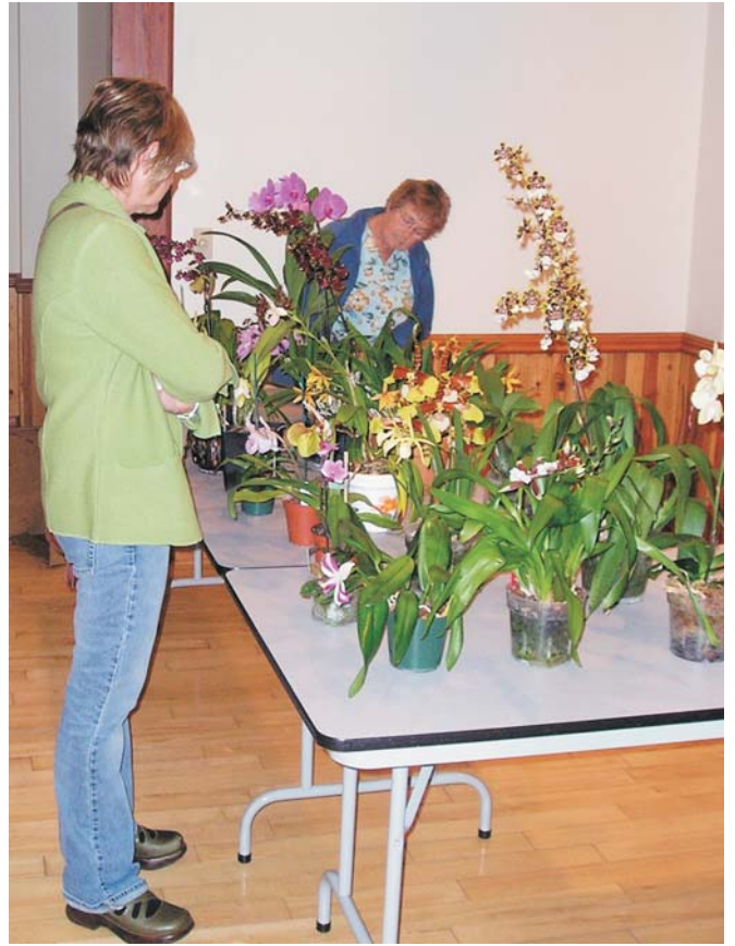
Show table at the Okanagan OS, Kelowna BC