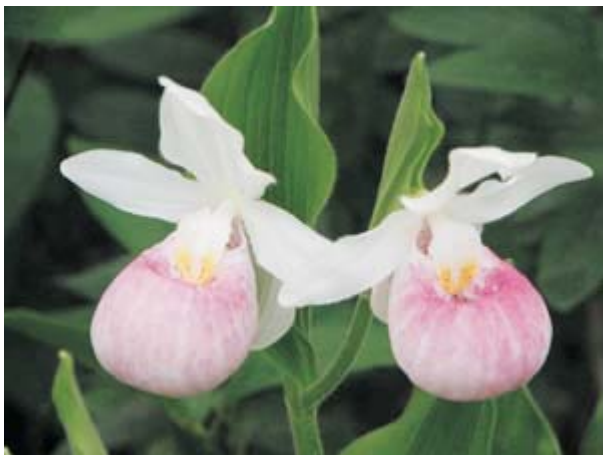
Showy Lady's Slipper Cypripedium reginae

http://www.canadiangeographic.ca/cea2007/winners.asp