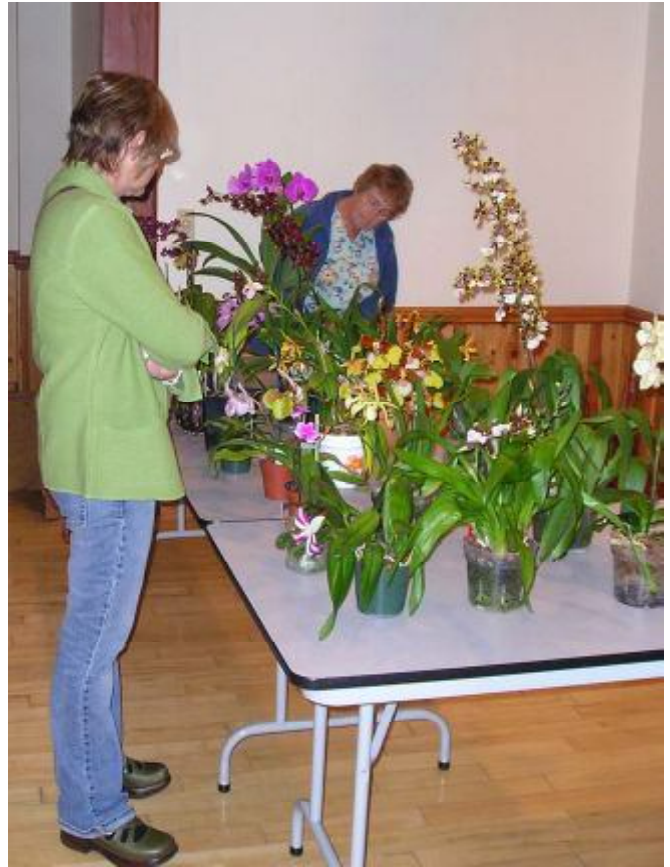
Show table at the Okanagan OS, Kelowna BC