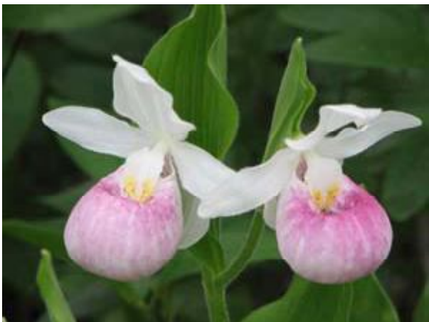
Showy Lady's Slipper Cypripedium reginae

Native Orchid Conservation Inc. http://www.nativeorchid.org/ Brokenhead Wetland Ecological Reserve http://www.gov.mb.ca/conservation/pai/mb_network/brokenhead/index.html Conservation Award Winners http://www.canadiangeographic.ca/cea2007/winners.asp