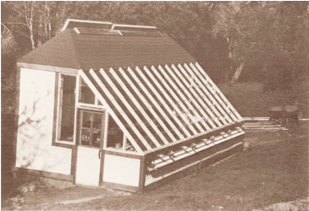
One solar greenhouse design - from The Solar Greenhouse Book