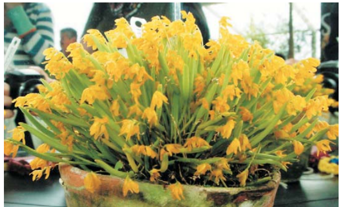
Aclanthera sonderana 'Gigi'