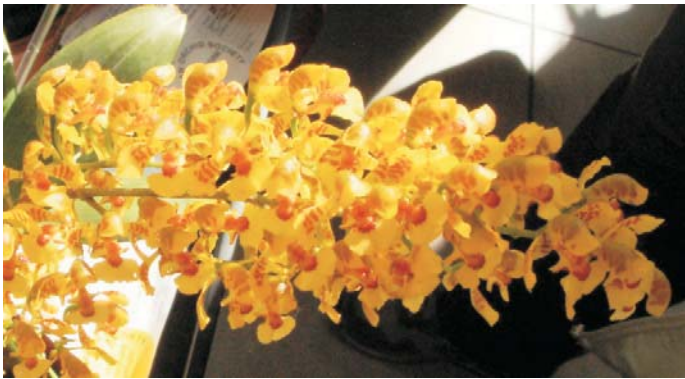
Oncidium gutfreundianum , CHM AOS