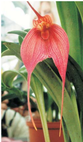
Masdevallia angulata x Dracula vampira