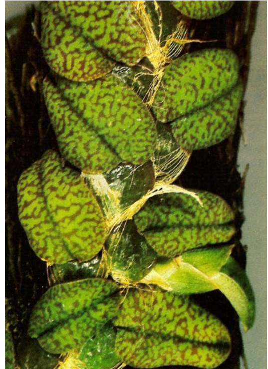
Oncidium limminghei

bark as it needs a drying-off period after watering. O. calochilum is another choice species. It is very tiny and the foliage resembles a cluster of pine needles. The relatively large yellow flower has pointed sepals and petals and a beautifully fringed lip. Medium light is sufficient so this plant can be grown under fluorescent lights, mounted on a slab of cork or open tree fern. Do not make the mistake of padding the mount as it does not appreciate constantly wet roots.