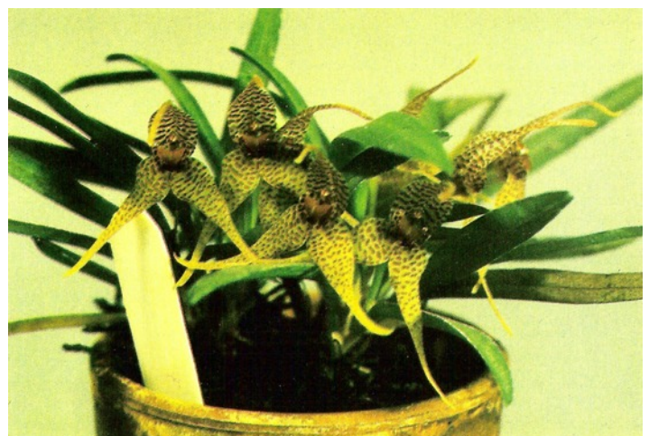
Dryadella edwardii

Capanemia uliginosa is a pretty little plant from Brazil. It has stiff leaves atop tightly packed pseudobulbs, and forms a compact plant standing only 4-6 cm tall. Every spring the bulbs produce dense, long lasting sprays of fragrant white flowers, making a truly delightful show. Its culture is undemanding. Mount it on tree fern with a cushion of moss and give it moist, intermediate to warm growing conditions.