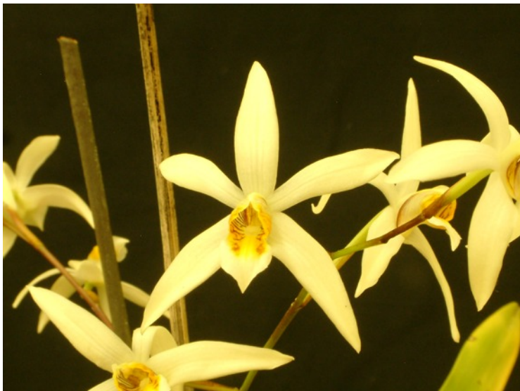
Epigeneum acuminatum 'Tropical Gardens Orchids' CHM- AOS 81 points, Calvin Wong