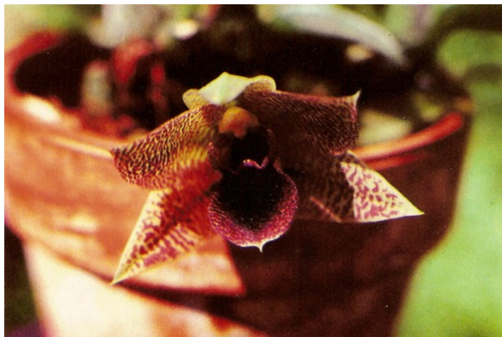
Promenaea stapeliodes

Because mounted miniatures have to be sprayed daily, it is convenient to group them together in one growing area. Hardware cloth or pegboard, set an angle under the fluorescent fixture, forms an effective support for the mounts. If a plant is in serious trouble we have found that placing it in a small pot of fresh sphagnum and enclosing the whole with a plastic bag may save the plant. Sphagnum moss is widespread in Canada, growing wherever black spruce and tamarack are found.