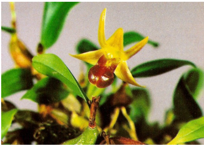
Epigeneium nakahara

One of the charms of Epigeneium (Dendrobium) nakaharai , from Formosa, is its free-blooming habit. The plant forms a branching chain of 2-3 cm angled pseudobulbs, each with a 3 cm leathery dark green leaf. It grows quickly and each pseudobulb produces from its apex a large (2.5 cm) waxy yellow flower, with a very shiny reddish brown lip. When that flower fades, another can appear from the same bulb, and that trait combined with the constant branching growth, assures lots of flowers. It is grown best on a tree fern slab in intermediate to cool temperatures and in medium light. This is one of those plants that is rarely troubled by disease and demands no extra attention in culture.