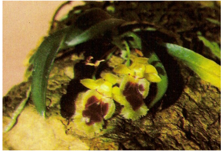
Haraella odorata

mount. As it occurs at rather low altitudes, it does best with warm temperatures and high humidity, making it a good subject for terrarium culture.