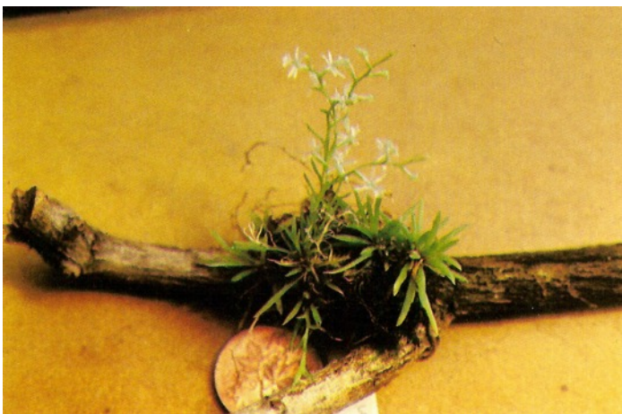
Phymatidium delicatulum

Phymatidium delicatulum is a diminutive little plant, standing only 2-3 cm high. It comes from Brazil. The plant has a tuft of light green grassy leaves, and many fine roots. It blooms in the summer, generously producing spikes of tiny white flowers that are as fragile looking as the name suggests. The plant must be grown in a shaded location and kept constantly moist. Care should be taken with this plant as it is easily rotted. It is a good idea to grow it on a branch padded with a little osmunda. Alternately, to provide good drainage, it could be mounted on a cross-section of tree fern pole.